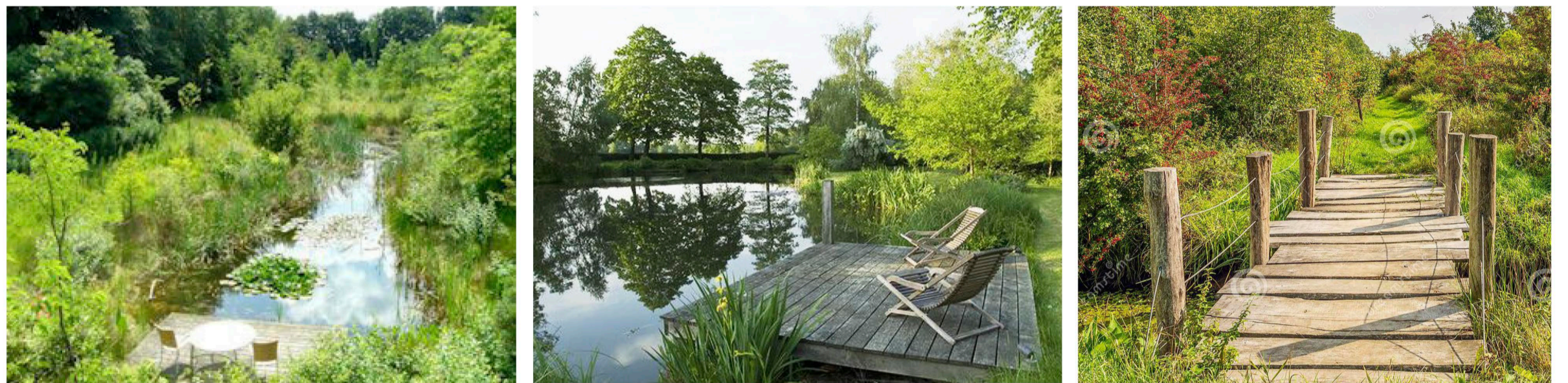
3. Widen existing wetland area to create a more significant water-body along with new habitat areas for wildlife. 4. Decked area with seating opportunities to edge of the newly created pond. 5. Simple timber bridges crossing water-body.