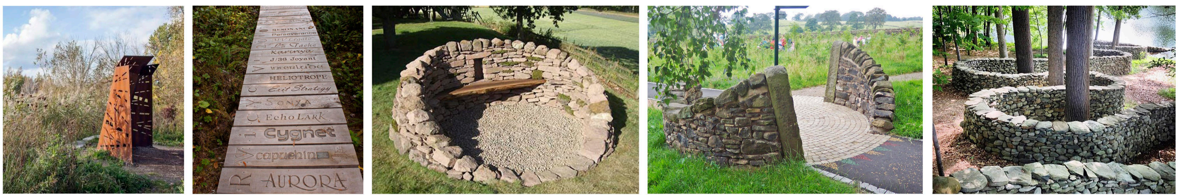
6. Replace existing bird hide with more visually attractive feature. 7. Decked walkways create potential opportunity for artwork feature or personalised memorials. 8. Enclosed stone-built feature seating areas. 9. Stone/drystone wall entrance feature to site with potential for integrated welcome signage. 10. Sculptural drystone walls weaving through woodland areas of the site.